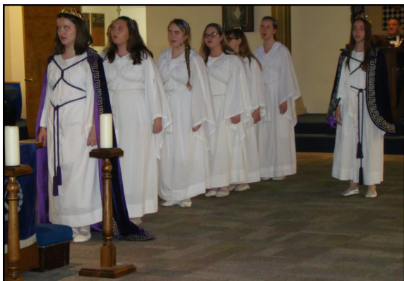
The Job's Daughters Bethel 21 young ladies joined us and presented their Closing Cross Ceremony