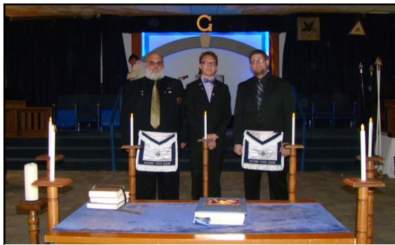
The DeMolay's told us about their Fraternity Precepts represented by the seven candles