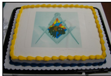
Custom celebratory cake was yummy.