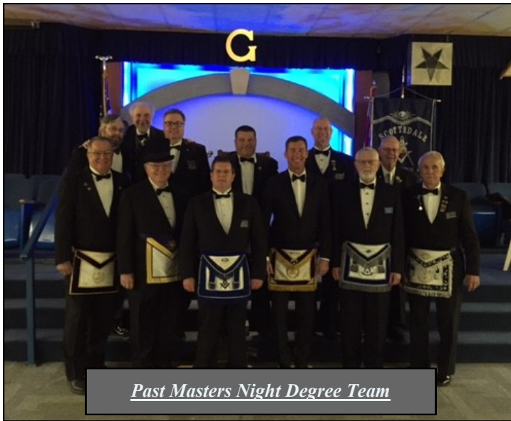
Past Masters Night Degree Team