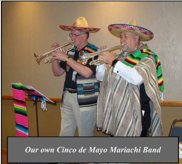
Our own Cinco de Mayo Mariachi Band