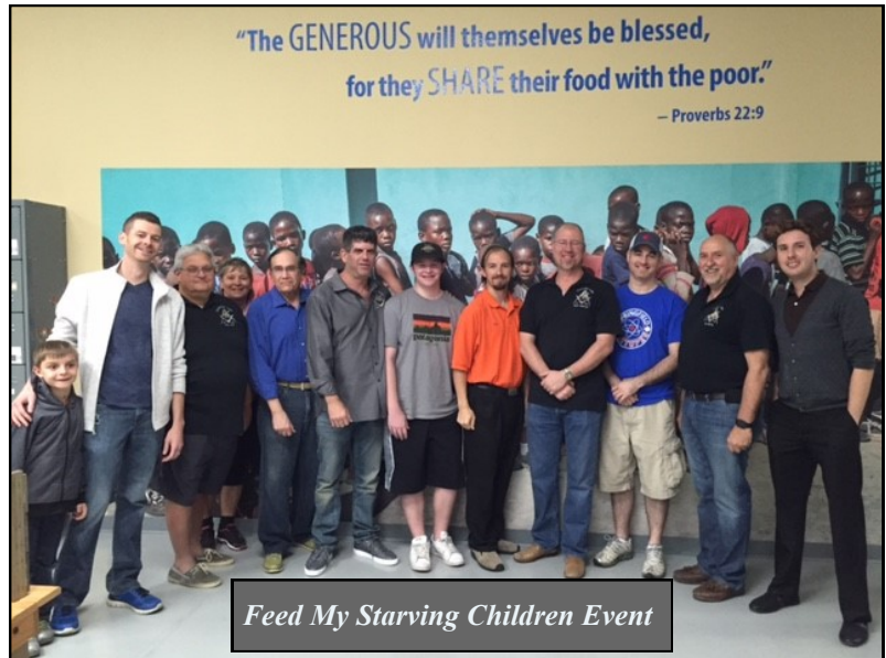
Feed My Starving Children Event

"The GENEROUS will themselves be blessed, for they SHARE their food with the poor." - Proverbs 22:9