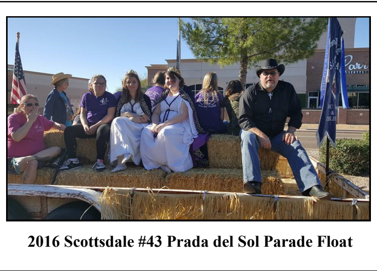
2016 Scottsdale #43 Prada del Sol Parade Float