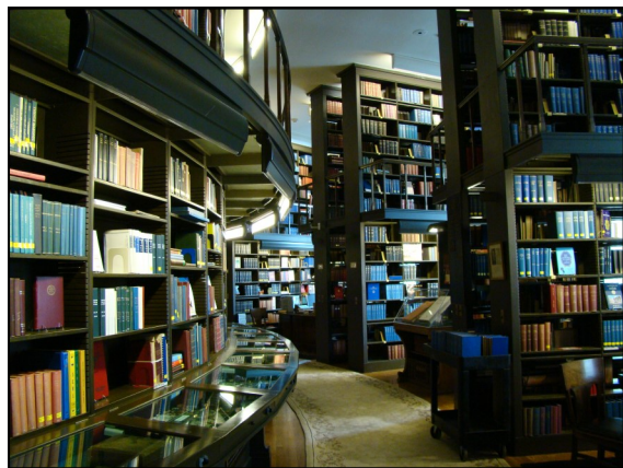
A small glimpse of the Library