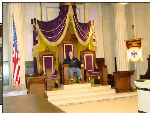
Your TB Editor testing the chair