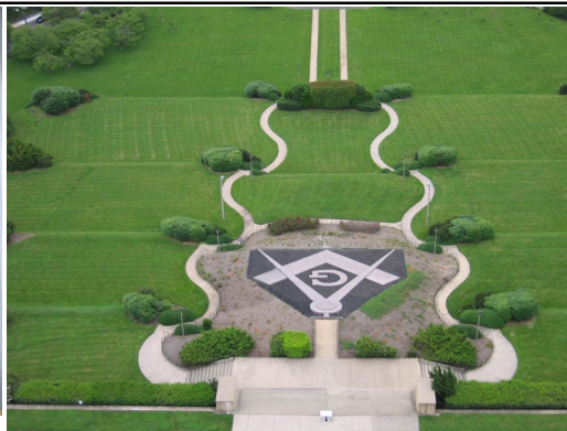
Looking down from upper balcony