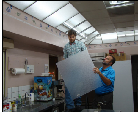
Let there be even more light on our work