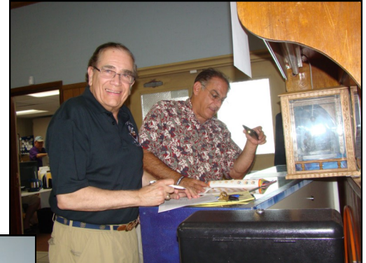
Getting ready for Fall logo shoppers