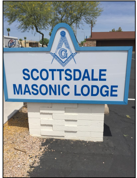
Here is a picture of the new sign skins.