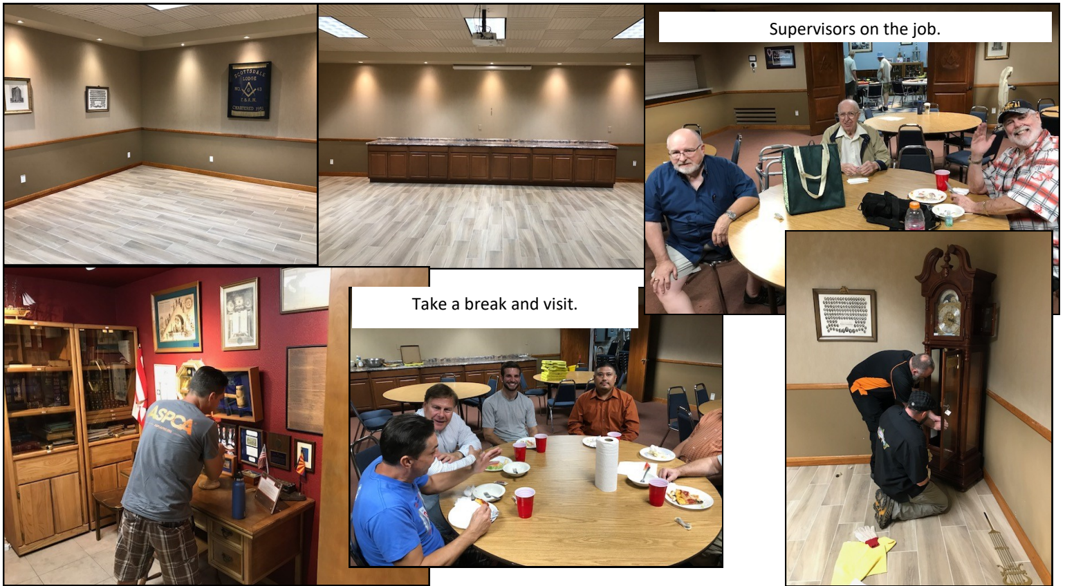
Summer work projects and Brotherhood