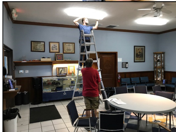
Seeking more light