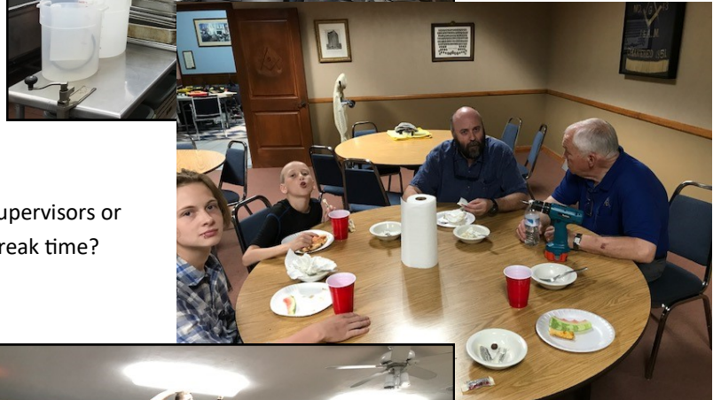
Supervisors or break time?