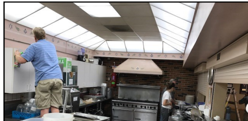
Jobbies at work