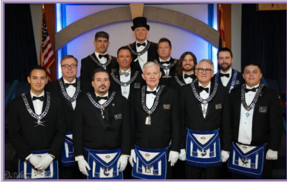
The Officers of Scottsdale Lodge #43 F&AM for 2018