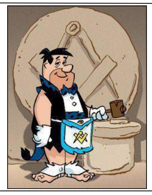
Do you ever study how long ago our fraternity really started? Check out a book in the lodge library.