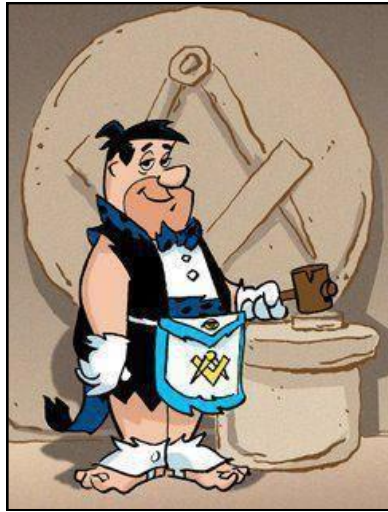
Is there any resemblance?