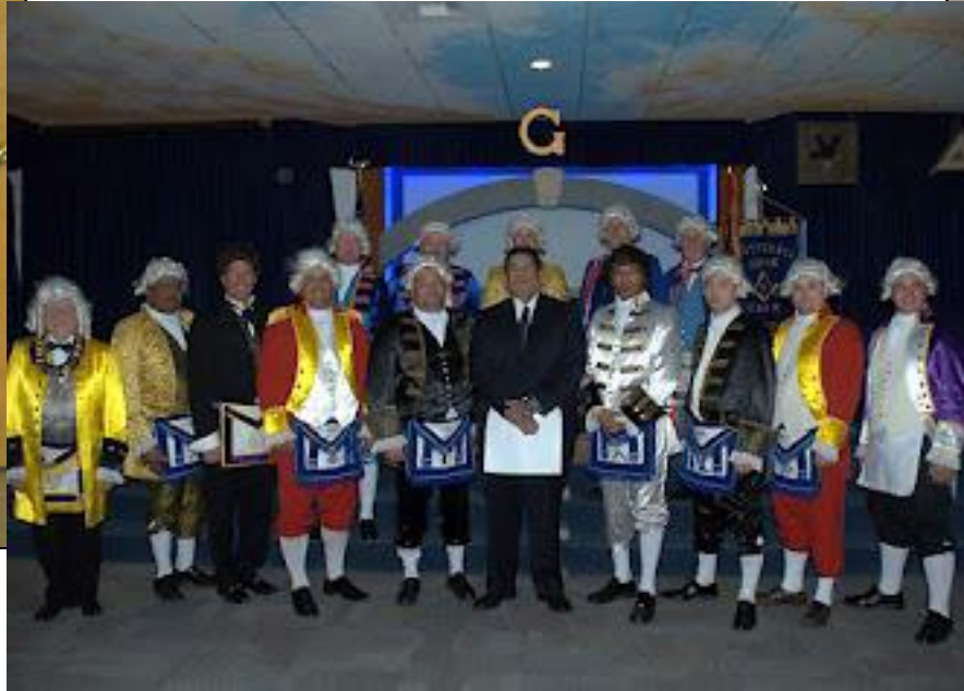
Colonial Degree Team