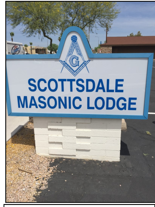
Here is a picture of the new sign skins.