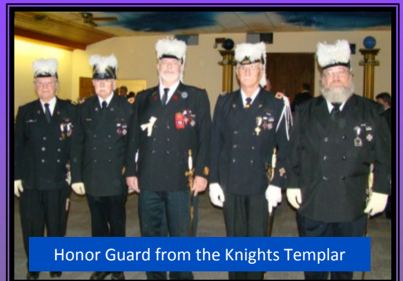
Honor Guard from the Knights Templar