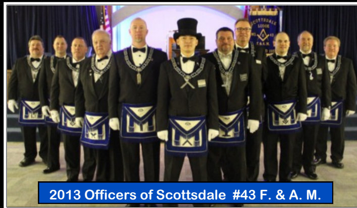
2013 Officers of Scottsdale #43 F. & A. M.