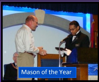
Mason of the Year