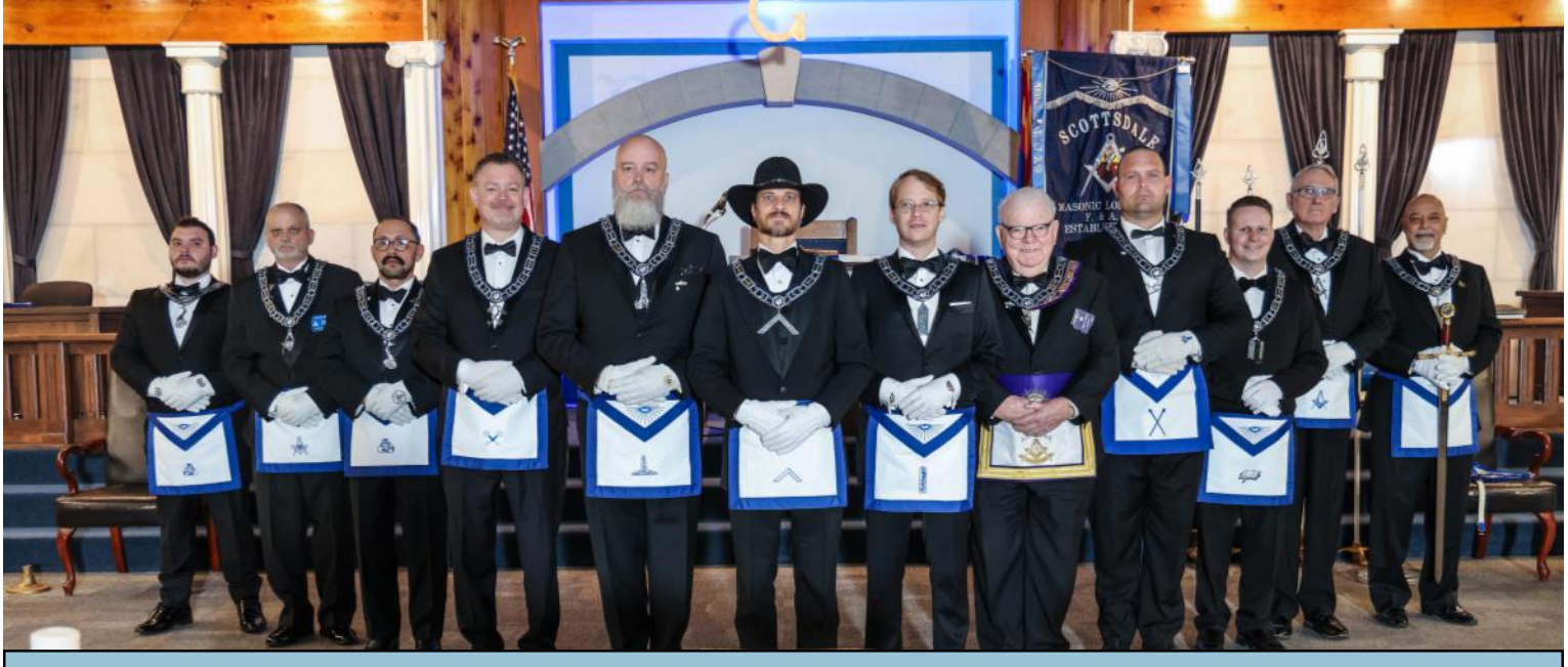
Scottsdale Masonic Lodge #43 Office Line for 2024