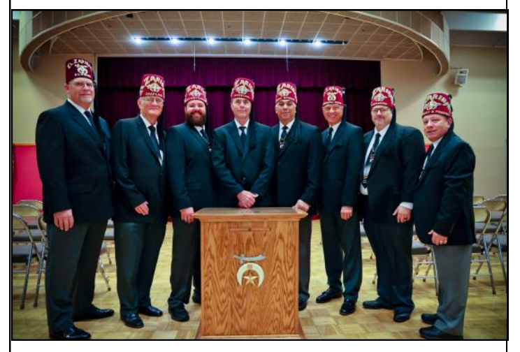
2024 El Saribah Divan