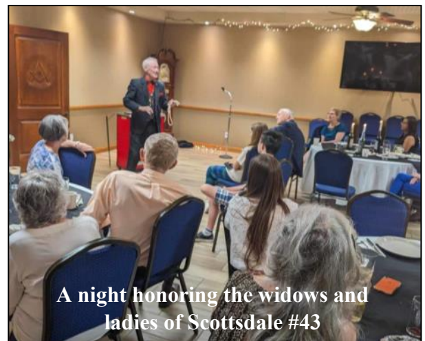
A night honoring the widows and ladies of Scottsdale #43

NOTE: If your name is on the list and you already paid your dues or have a lifetime membership, please contact the Secretary, so the database can be updated.