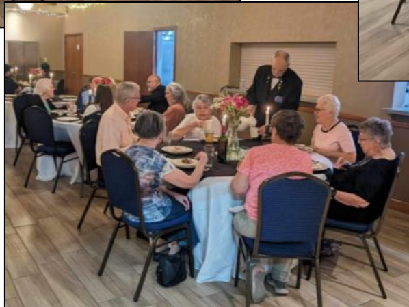
A night honoring the widows and ladies of Scottsdale #43